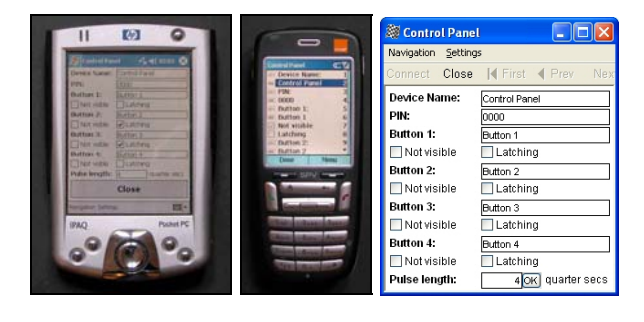
Figure 4 – Remote device settings screens (Pocket PC, Windows Mobile, Windows)