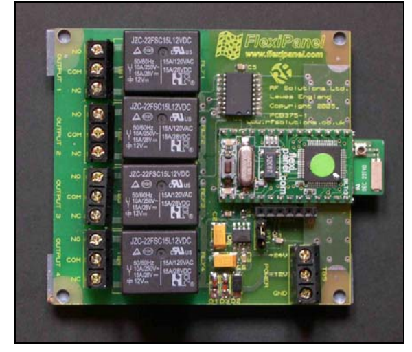
Figure 2 – Bluetooth Remote Controller (Case not shown; appearance may vary)