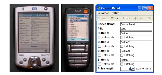
Figure 4 – Remote device settings screens (Pocket PC, Windows Mobile, Windows)